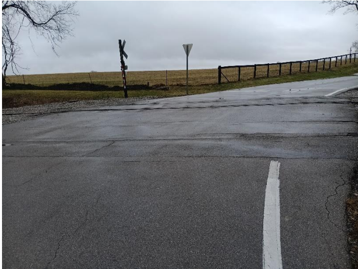
Steele Road – looking North (County Road 1685) Sidetrack in foreground Main Line in center