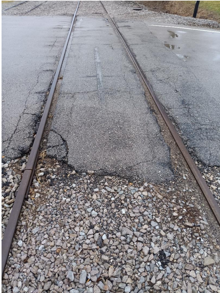
Steele Road looking East at Milner KY