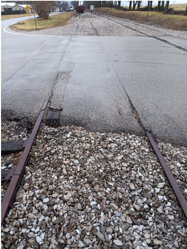
Steele Road looking West through Milner KY (County Road 1685)